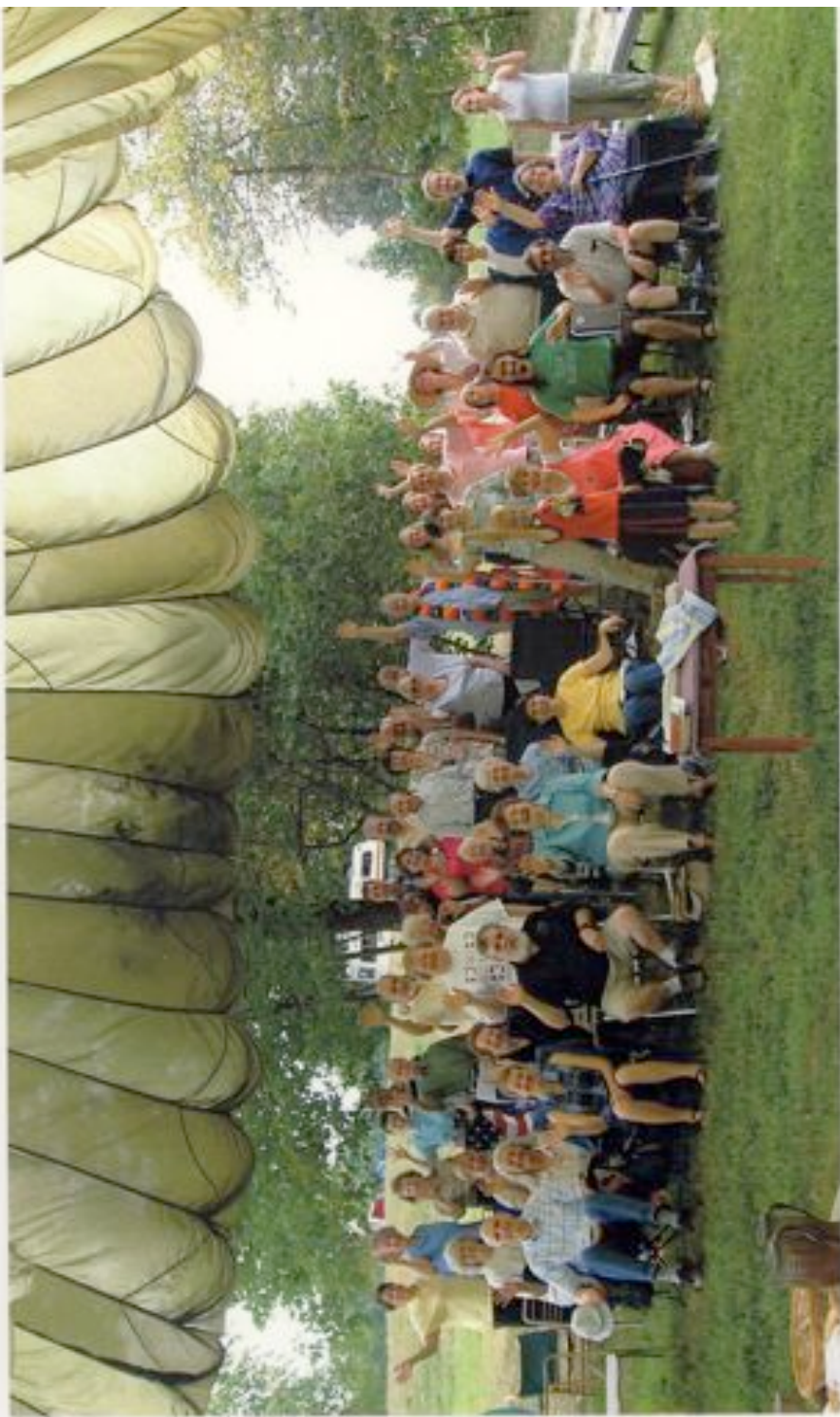
Sunday Service at the Miller Pond