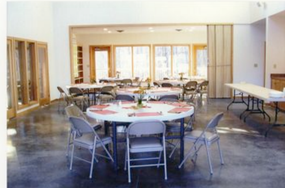
Our First Pitch-In in our new addition – Stewardship Dinner November 22, 2009