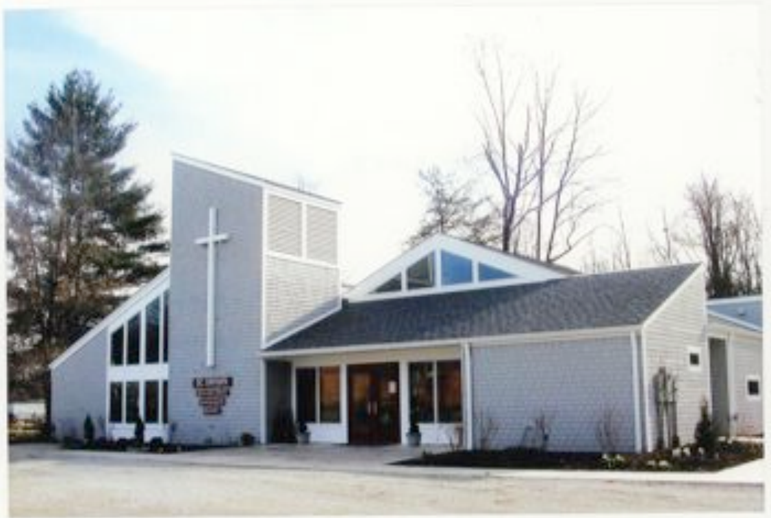
St. David's New Church Building – November 22, 2009